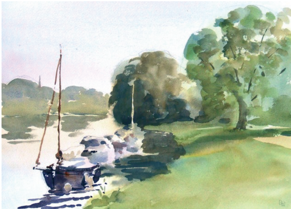
'Tuckton, River Stour' watercolour 10" x 14" ~ David Webb